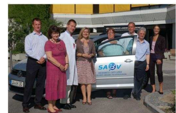
Specialised ambulatory palliative care (SAPV)